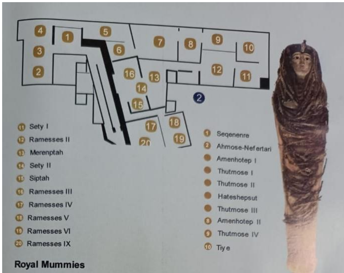
Fig. 4 a. Plan of Mummies Hall, NMEC © Mervat Maher.