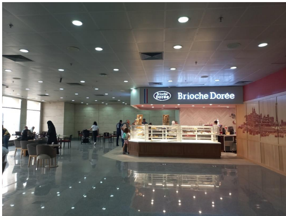
Fig.7. Restaurant and Coffee, NMEC