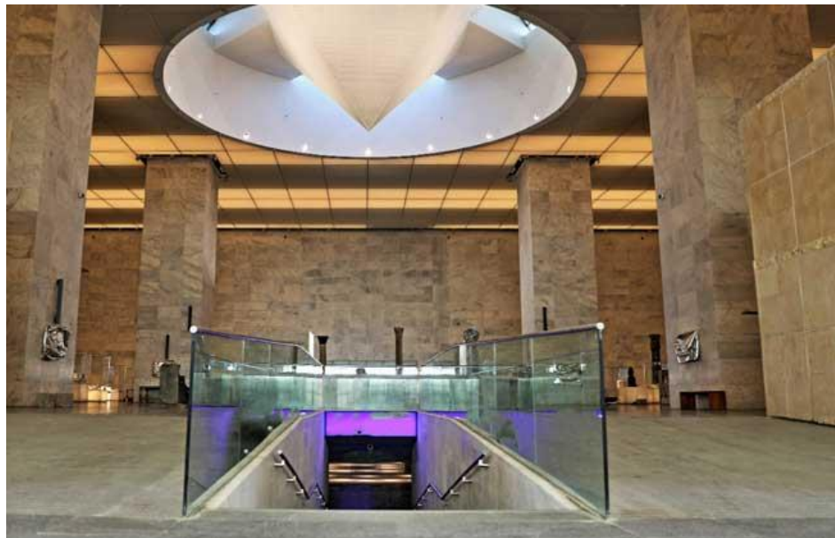
Fig.2. The main exhibition hall of NMEC