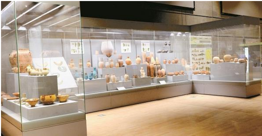
Fig. 3. Group of pottery in ancient Egypt, NMEC © Mervat Maher