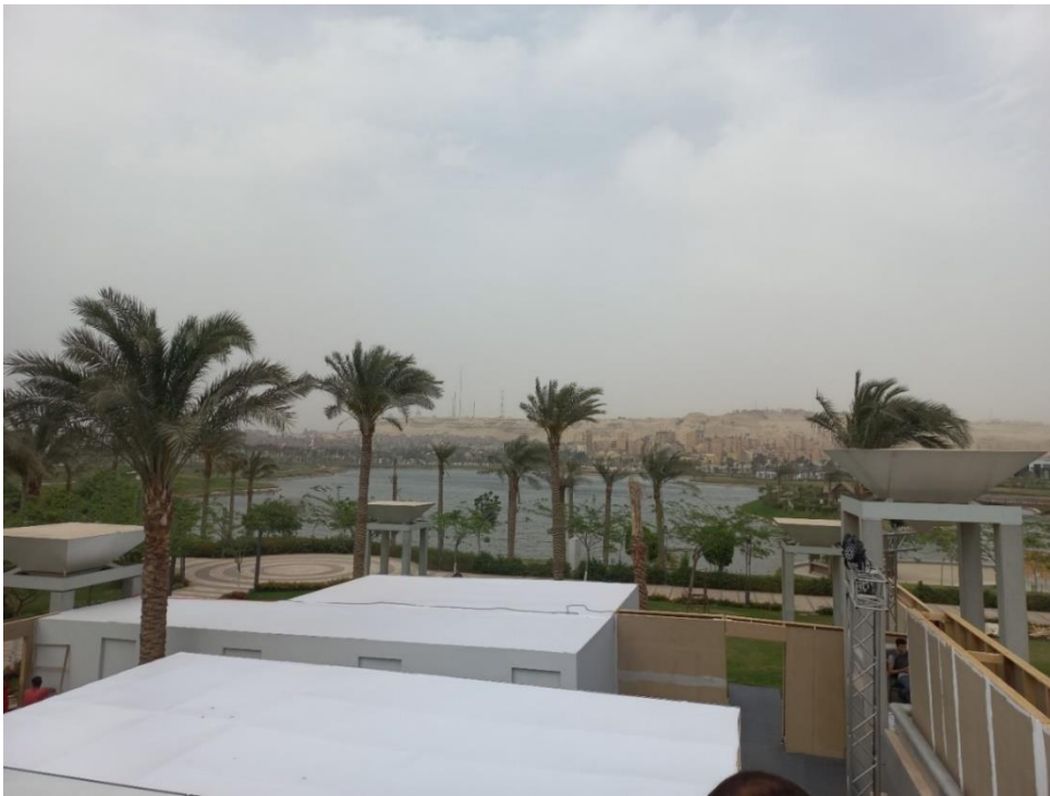
Fig. 6. The lake of Ain Sera, NMEC