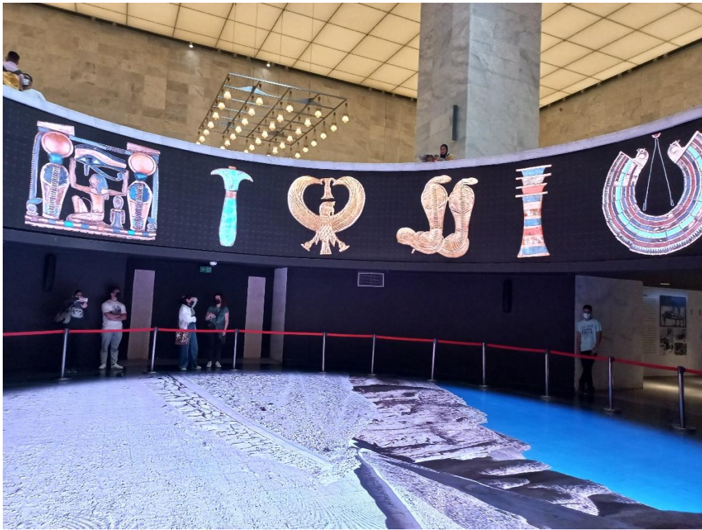
Fig. 4 b. Entrance to Mummies Hall, NMEC © Mervat Maher.